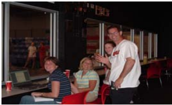
Having fun with friends at end of the year party.

Parents, coaches and players gathered together to celebrate season successes