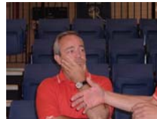
Pondering strategies for next season.

“It takes an incredible amount work to be successful, and we are fortunate to have so many people working so hard,” he added.