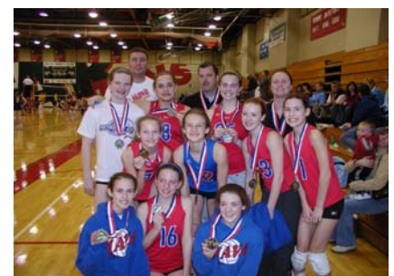
13 Ragland wins silver at Central Zone

In Dayton, the team went in ranked 12th out of 21 teams. They finished in 2nd place to the MAVA 13 Elite team losing 18-25 and 9-25. The girls played very hard throughout the tournament taking four teams to three games. They won every match until the championship. Congratulations!