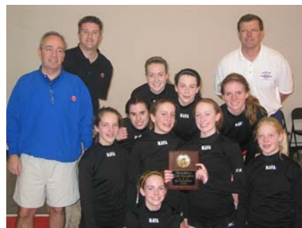
14 Elite won the 16s division of the MAVA Challenge

On the good news front, the team is excited about the impending