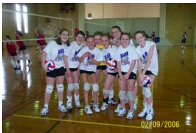
13 Haury won 15 straight matches in early season play