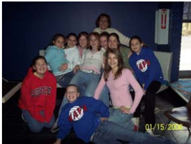
The 12-Rickert team is working hard to realize its potential