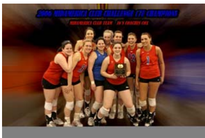
16-Cox won the 17s division at the recent MidAmerica Challenge