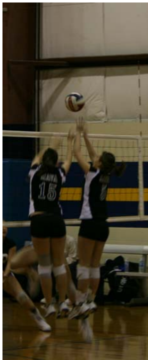
MAVA 15 Elite players get up to block.