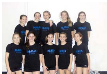
MAVA 13 Elite won all their matches in the inner club jamboree and are poised to continue their success.

The 13s looked especially strong. The 13 Elite team won their matches