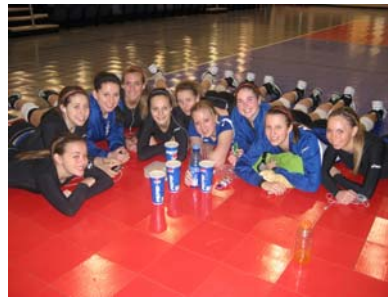
Members of MAVA's 16 Elite take a break. The team has kicked off the season with strong showings.

Our MAVA 16 Elite had an awesome start to the 2007 Season. They played in the Louisville Icebreaker tournament (18 Open Division) on January 27 where they met a lot of very talented teams. While they ended up losing in the quarter finals to come in 8th out of 16 teams, it was still quite a respectable finish for a 16s team playing in the 18s. Their second tournament for that same weekend was the Central Zone Shootout #2 in Indianapolis where they