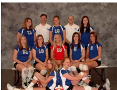
MAVA 15 Hammerheads are looking forward to a successful season.