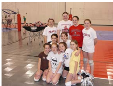
12 Elite has set their sights on getting to Minneapolis for the Junior Olympics.

The highlight of our day was winning our match against KIVA 12 Red. We lost to them in the first game, 22-25. The second game we came out strong