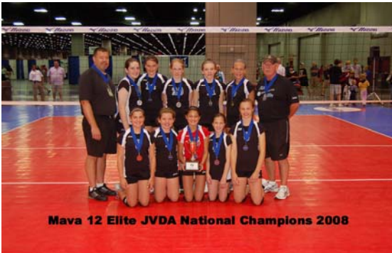
Mava 12 Elite JVDA National Champions 2008